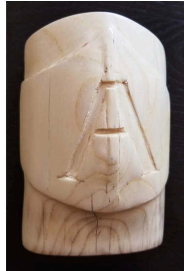
Sculpture – “Asian Face in the Era of Pandemic”