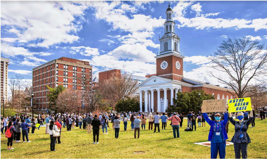
Photograph – “UK Rally on Stop Hate”