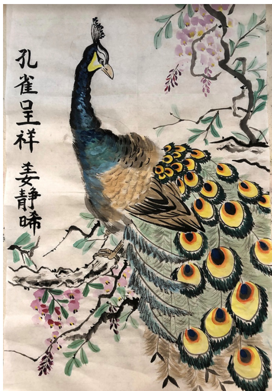
Painting – “From restraint to color”

Senior Academic Coordinator & Adjunct Assistant Professor Scientist College of Arts & Sciences