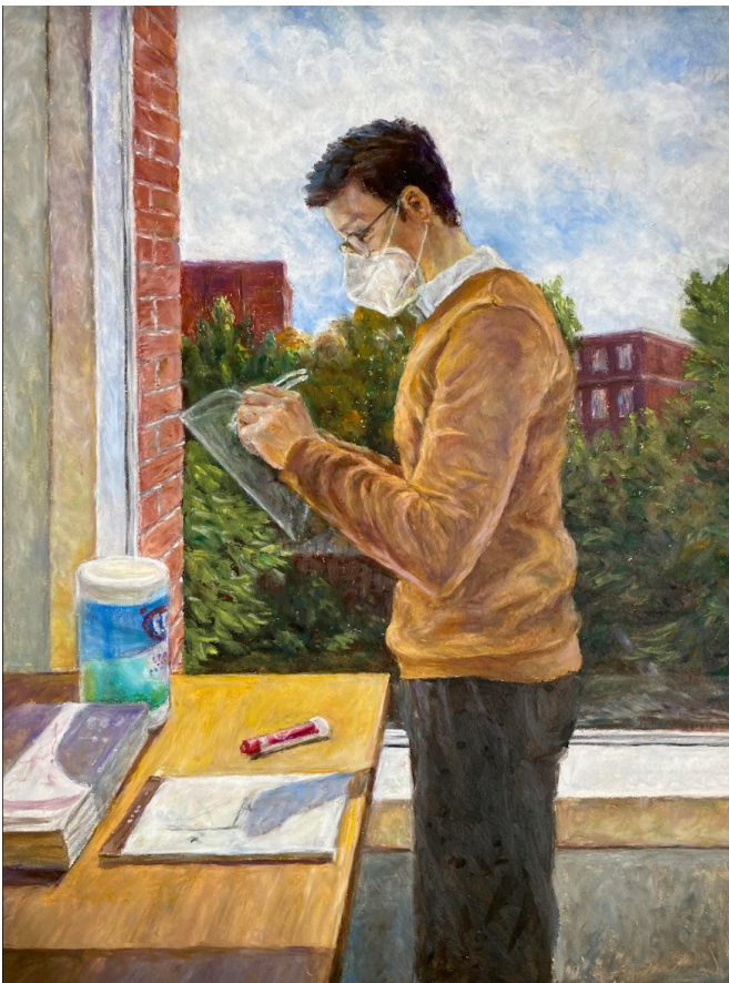
Oil painting – “Gearing up before Teaching—My War against COVID”