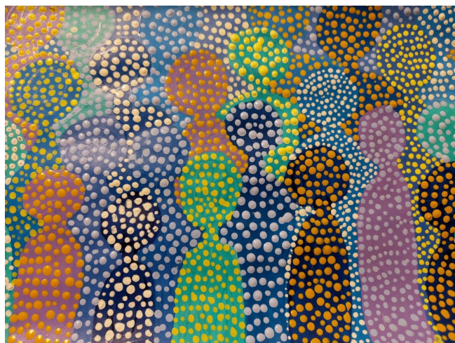
Drawing – “Who here has Covid 19?”